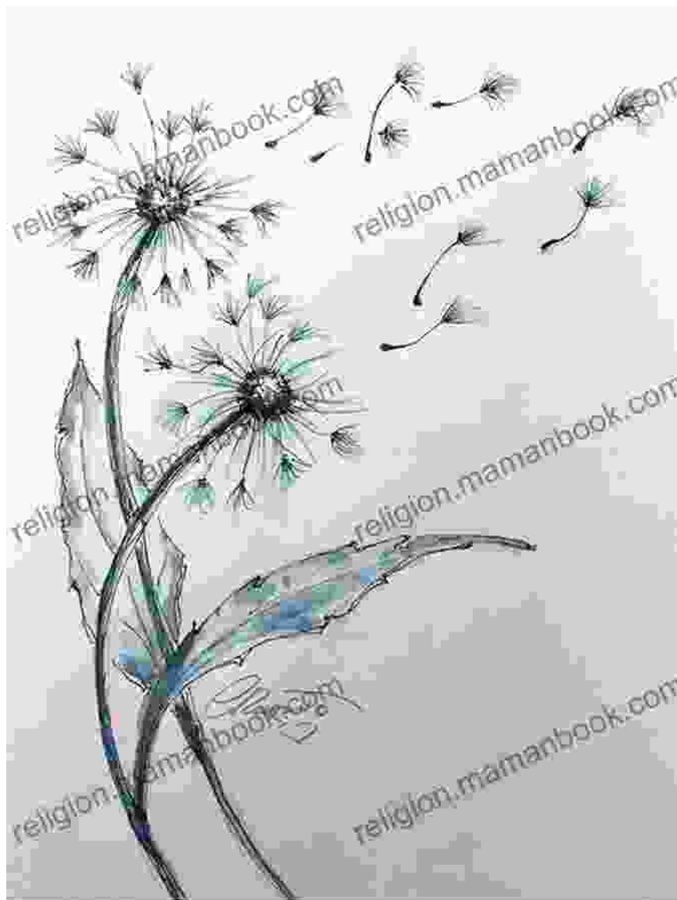
Original drawing of a dandelion