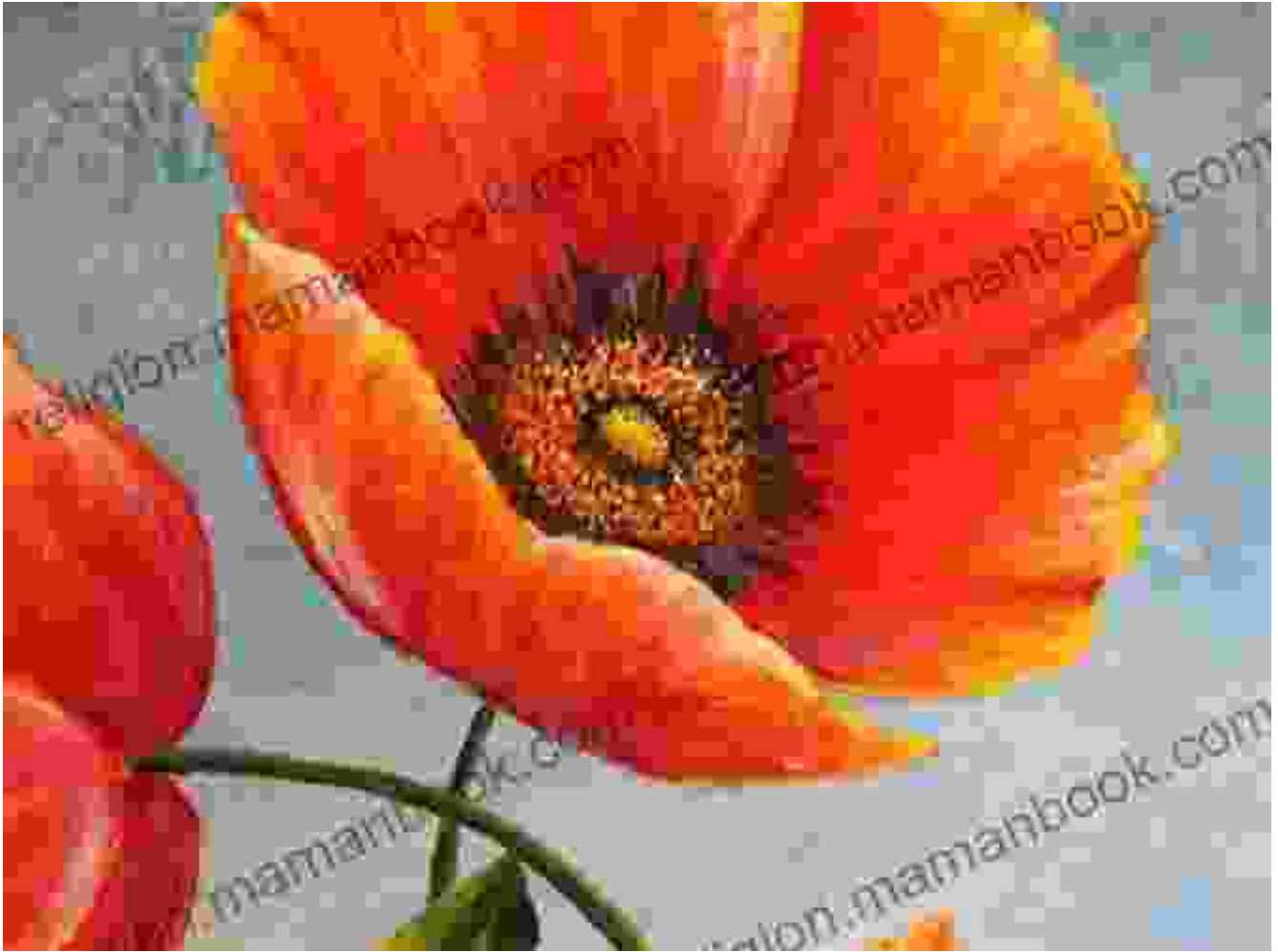
Original drawing of a poppy