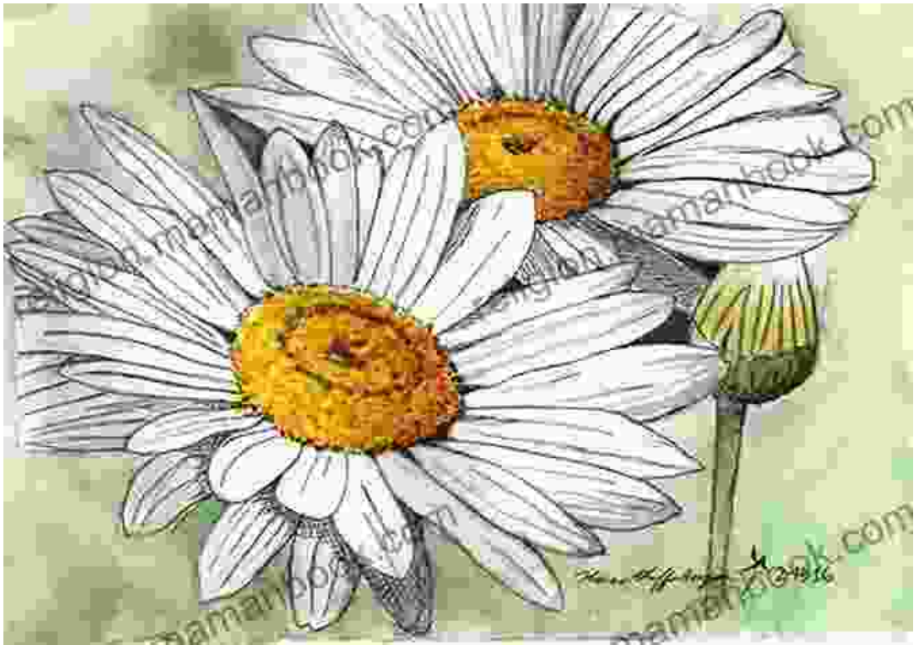
Original drawing of a daisy