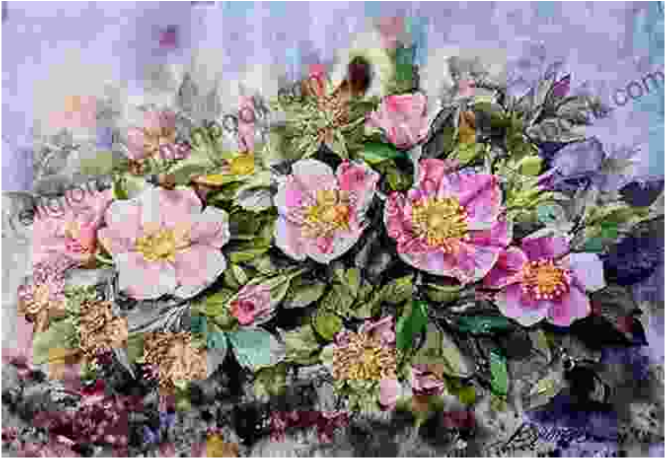
Original drawing of a wild rose