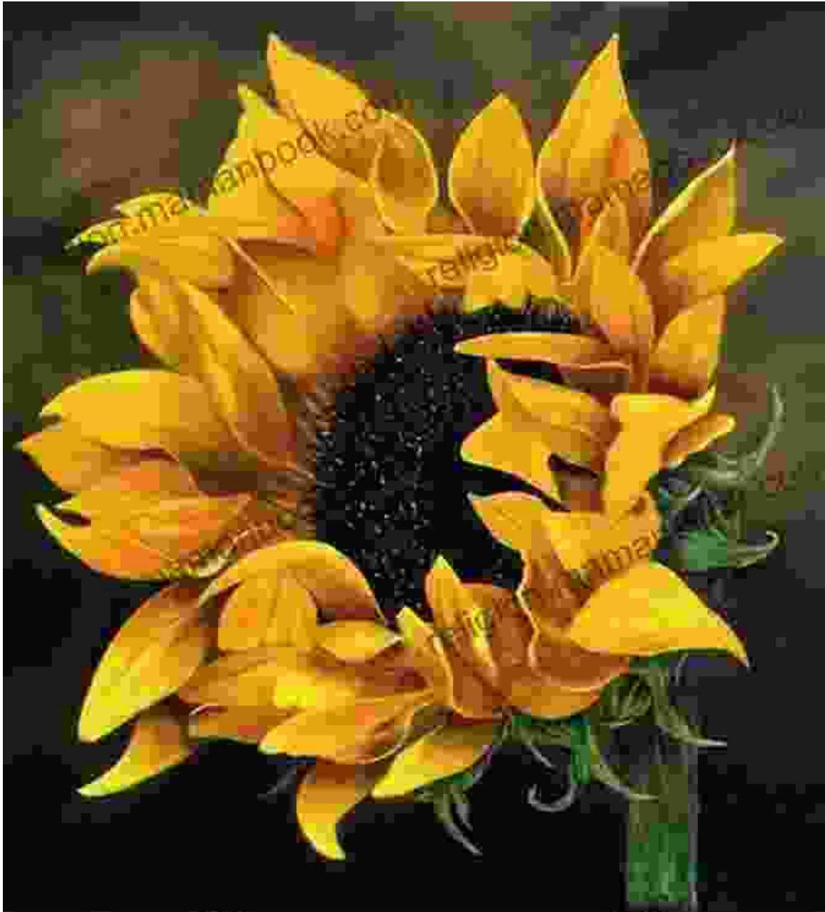
Original drawing of a sunflower