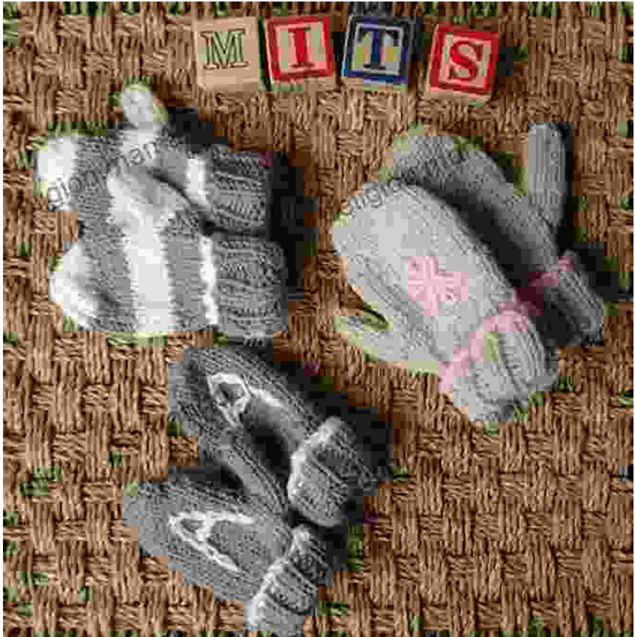
A pair of knitted animal mitts with a playful penguin design

If you're looking for a pair of mitts that are both practical and stylish, consider a pair of knitted mitts with a ribbed cuff and a warm lining. These mitts will keep your hands protected from the cold while also adding a touch of fun and personality to your winter outfit.