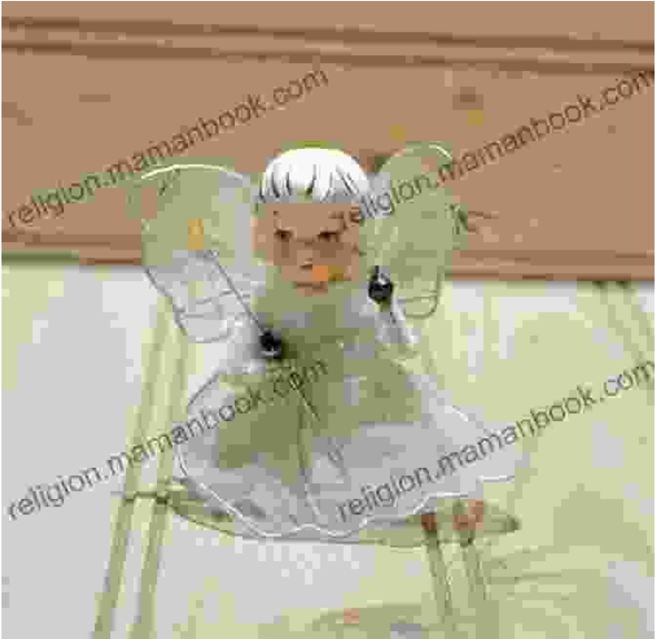
The angel ornament's head with embroidered eyes, nose, and mouth